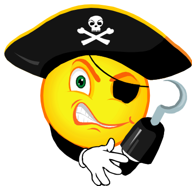
It's Cap'n Chris

We found a winning formula of batting first ... and then applying pressure with the spin quartet